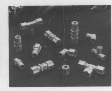
Plastic Fittings Available For All Types of Metal Tubing

· A line of plastic fittings suitable for use on all types of metal and plastic tubing are available in many configurations. The fittings are said to cost less than metal fittings, and absorb mechanical and acoustic vibrations better, because they have low densities. They also are inert to galvanic action which occurs when metal fittings and tubing of dissimilar metals are connected together. The fittings can be used with copper tubing, aluminum or steel tubing, as well as plastic tubing. Made in 1/4" thru 5/8" tube O.D. sizes, they are manufactured in nylon, polypropylene, acetal or Kynar. Nylon fittings have good resistance to organic solvents, oils and gasoline and retain good strength at high temperatures. They are ideal for both cold and hot-water applications, and stand up well to long-time weathering.