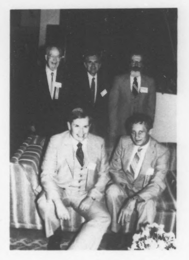
Committee on Communicable Diseases Affecting Man