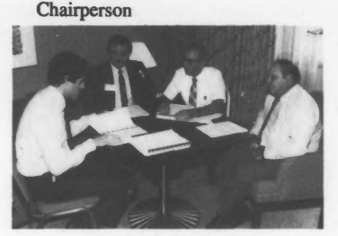
Farm Methods Committee