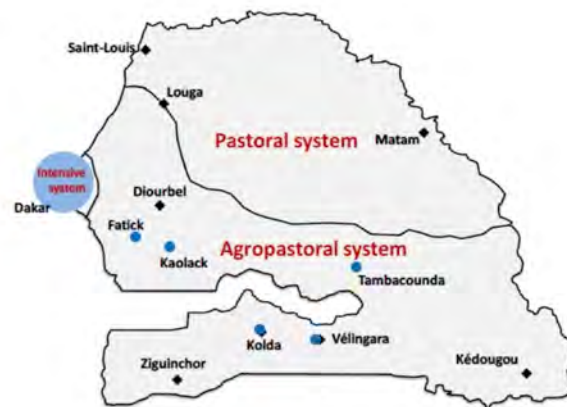
Figure 1. Dairy production system Senegal (19).

Senegal has a tropical hot and humid climate with a dry season from November to May and a rainy season from June to October (65). Variations in temperature and the frequency of extreme climate events directly affect livestock performance and welfare. They indirectly affect animals by changes in feed and grassland availability and