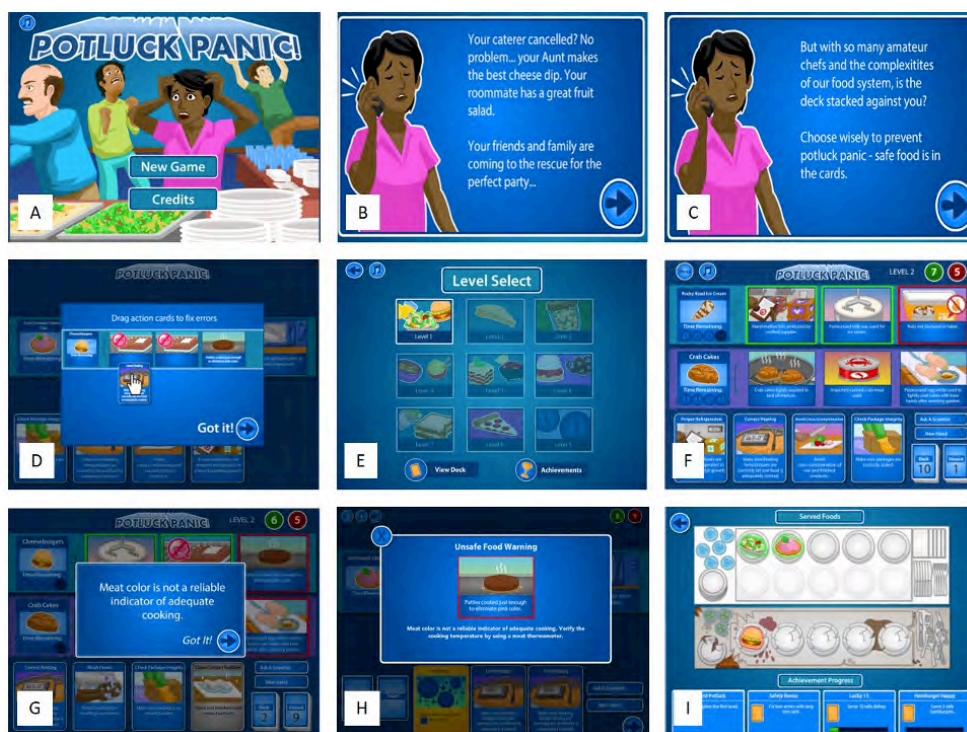
Figure 1. Potluck Panic! game: (A) home screen; (B and C) storyline; (D) instructions; (E) challenge levels; (F) main play screen; (G) Ask-a-Scientist feature; (H) corrective feedback for errors; and (I) summary screen for risks minimized and game progress.

Potluck Panic! (Fig. 1) is an interactive Web-based game that challenges players to serve safe food at a virtual potluck party by recognizing and minimizing risky food-handling practices from production through processing, packaging, distribution, and final handling. Players are simultaneously presented up to two single- or multi-ingredient food products and three steps involved in the manufacture to final handling of the presented foods. One of the steps presented is done in error and presents a food safety risk. Food products presented include single- and multi-ingredient beverages, appetizers, salads, main dishes, and desserts, such as juice, fruit smoothie, rice, bean dip, dumpling, chicken salad, cheeseburger, seafood product, pastry, and ice cream, among others. Examples of risks presented include poor agricultural practices, cross-contamination, inappropriate