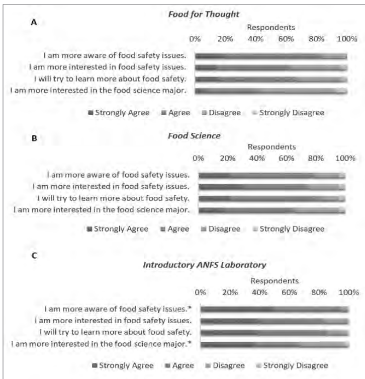
Figure 3. Impact of Potluck Panic! on food safety interest of student subjects enrolled in courses: (A) Food for Thought ( n = 93 ); (B) Food Science ( n = 23 ); and (C) Animal and Food Science Laboratory ( n = 140 ; * n = 139 ), as evaluated by agreement with responses to complete the prompt “As a result of playing Potluck Panic! . . . ?”