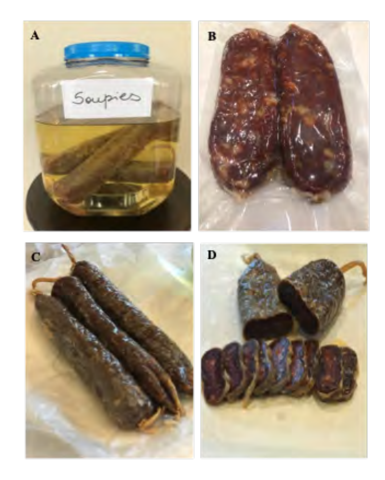
Figure 2. Photographs of soupie purchased at retail: A, chubs stored under oil; B, chubs stored under vacuum; C, chubs removed from oil; D, interior of soupie.