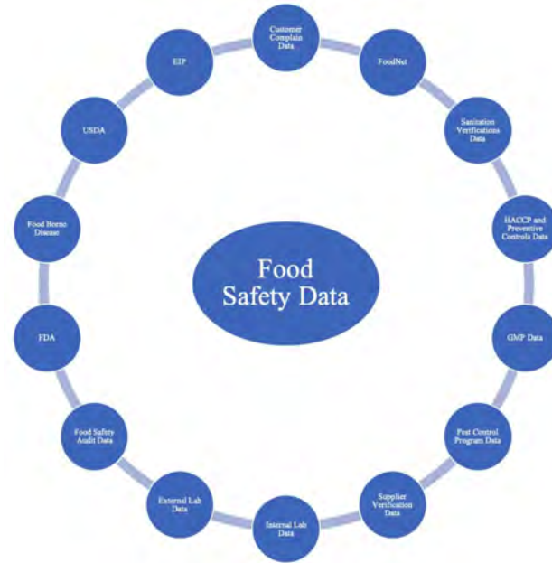
FIGURE 3. Elements of Food Safety and Quality “Big Data.”